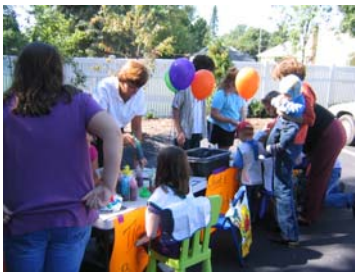
Tile Painting at the Open House

Our third annual open house was a huge success! October 1 st was a beautiful day and families, friends, and everyone who stopped by had a great time.