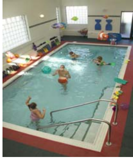
The pool at MINOR Improvements PT