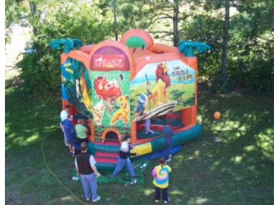
Lots of Bouncing in our Lion King Bouncy Bounce