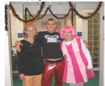
Halloween at MIPT