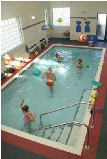
The pool at MINOR Improvements PT

The groups will officially start on Thursday September 8 th and Monday September 12 th and will run for 10 weeks. If you have any questions about the group or are interested in signing up please contact us as soon as possible as the groups will fill up fast.