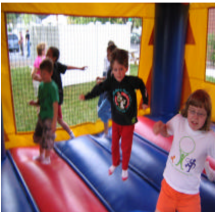
Fun in the Bouncy Bounce