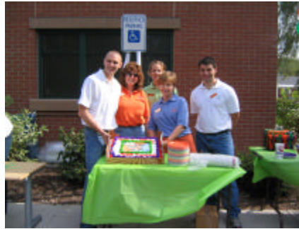
MINOR Improvements PT Staff