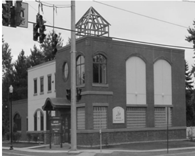
Our new building at the corner of West Avenue and West Circular Street in Saratoga

We're in!!!! We happily moved into our new home at 270 West Circular Street over Labor Day weekend. Many hands made light work and an easy move from Greenfield. Thank you to all those who pitched in!!