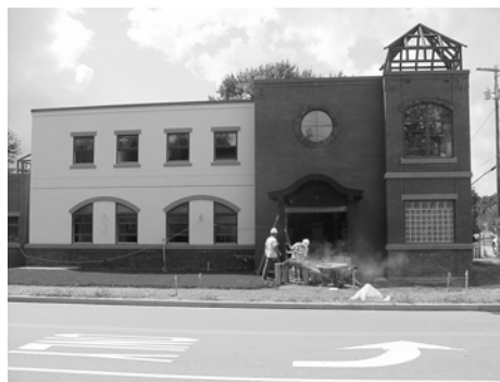
The all new MINOR Improvements PT gets some finishing touches

All is well as construction nears completion at our new site. August has been a busy month for our crew. The exterior of the building is nearly complete as the finishing touches are being applied to the interior. Flooring is being installed, walls are being painted, and the tile is up in the pool room. The salt water fish tank and furniture for the waiting room is ordered, and soon to be delivered. We also have sidewalks, and our very own parking lot complete with seventeen striped parking spaces (4 of which are handicap accessible). All that's missing is us...and we will be there soon. We have the countdown posted at our current facility to opening day at the all new MINOR Improvements PT. We will see our last patient in Greenfield on Friday August 29th, move Labor Day weekend, and begin treating patients in Saratoga on Tuesday, September 2nd!