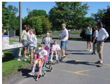
The team stops for a water break as they prepare for a push for the final mile

After the 5K several members of the MINOR Improvements team took a tour through the new building as construction continues.