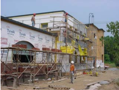
July 3rd exterior work at MINOR Improvements PT