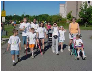
The MINOR Improvements team at the beginning of their 5K