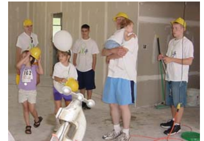
Inside the gym at the new MINOR Improvements PT