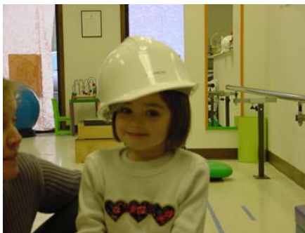
Getting ready for Demolition/Construction to begin